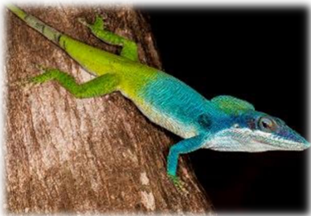
Cuban Blue-green Anole

From the coast it is possible to see the White-tailed Tropicbird. Marine terraces are a typical elements of the landscape.