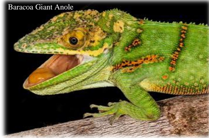
Baracoa Giant Anole