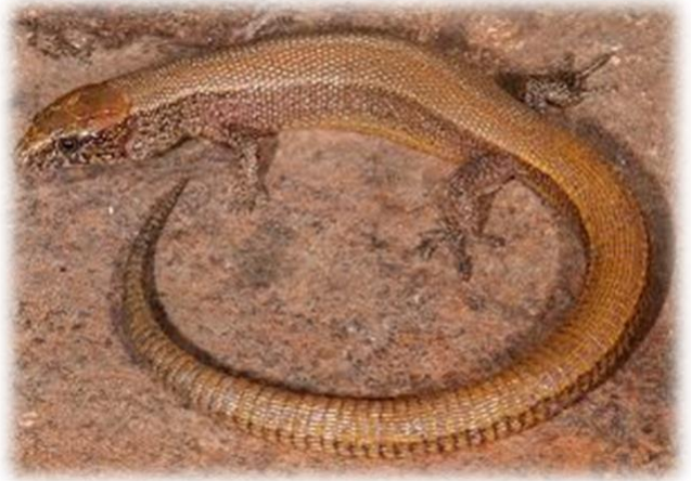
Cuban Night Lizard a Cuban jewel, one of the oldest vertebrates in the whole Caribbean region.

Breakfast at the hotel. Early departure to Cabo Cruz, one of the easternmost locations of Cuba. This extraordinary place holds a unique flora and fauna and is one of the most important centers of endemism in Cuba. It is also an important scenario of different historical events and an aboriginal settlement. We will visit El Guafe, a trail which is representative of the local biodiversity and landscape. The Cueva del Agua have one of the aborigine idols sculpted on rock. One of the living treasures of the area is the Cuban Night Lizard that belongs to a primitive family of saurians (Xantusiidae), and a representative of one of the oldest vertebrate lineages in the Cuban archipelago. There are also many species of anoles and curly-tailed lizards, and among them the Cuban Blue-green Anole is particularly conspicuous. Cabo Cruz is also the habitat of the Cone-shaped Tree Snail.