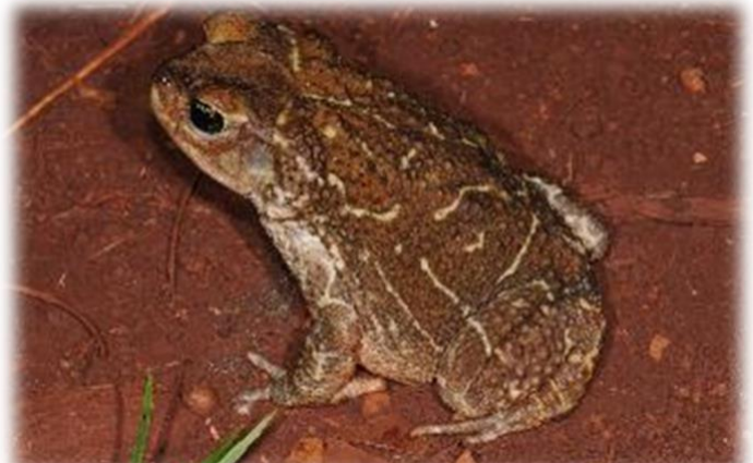
Eastern Giant Toad, a member of a toad's lineage endemic to the Caribbean Islands