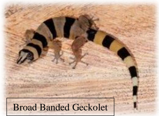
Broad Banded Geckolet

After Lunch, and around 3PM we will visit Los Monitongos, a geologic formation constituted more than 50 million years ago. The stranger forms of these hills have originated as a consequence of the elements, that softens their rocks, for the fluvial erosion and for the wind, factors that destroy the conglomerate.