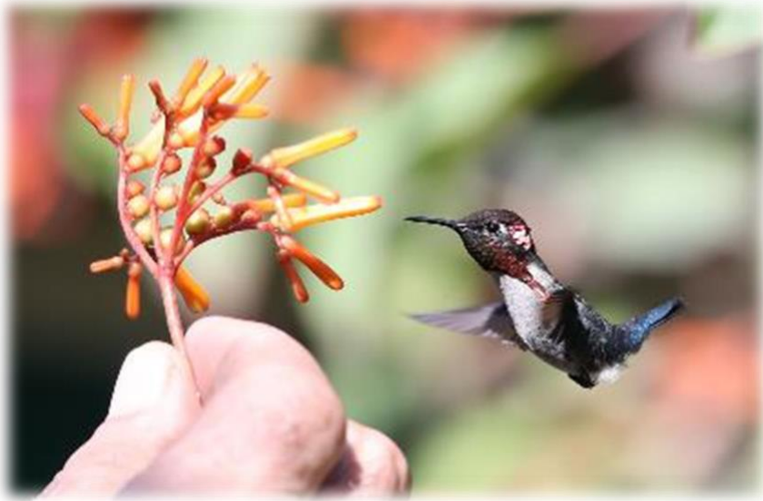
Bee Hummingbird (smallest bird in the world)